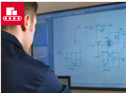
Manufacturing Process Control