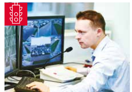
Traffic Management Centres

Quant contains patented and patent pending technology