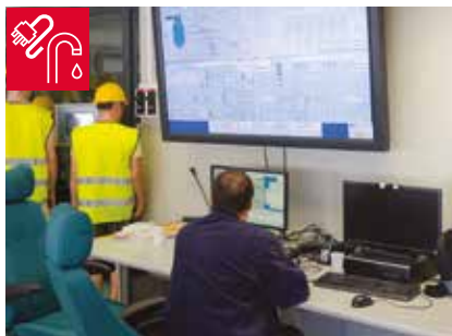
Utility Service Operations